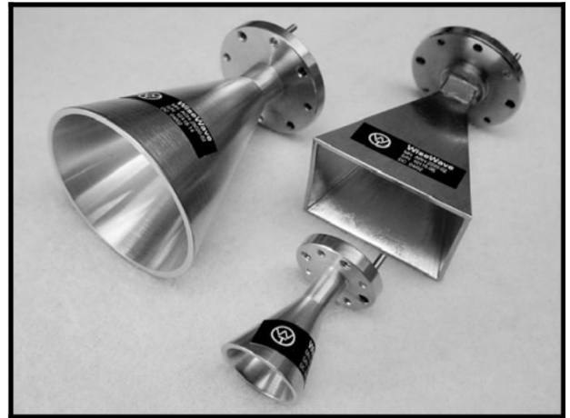
ACH & ARH Series