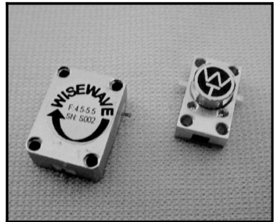
FID & FCD Series