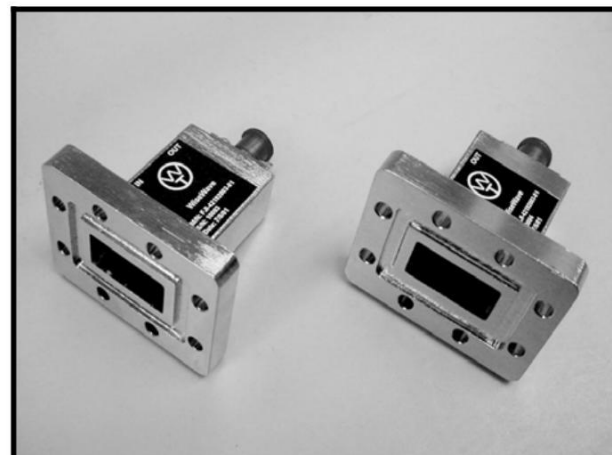
FII & FCI Series